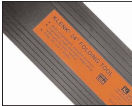
Raised finger ridges allow for better grip and leverage.