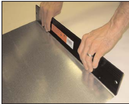
Klenk's folding tool -- one easy motion for 3/8" and 1" folds.