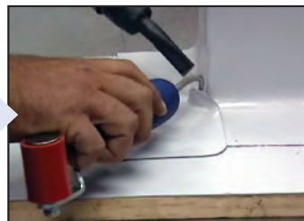
Model #MR05032 Soft-grip Plastic Handle

Use blunted tip of seam tester to lift material to seam in tight areas.