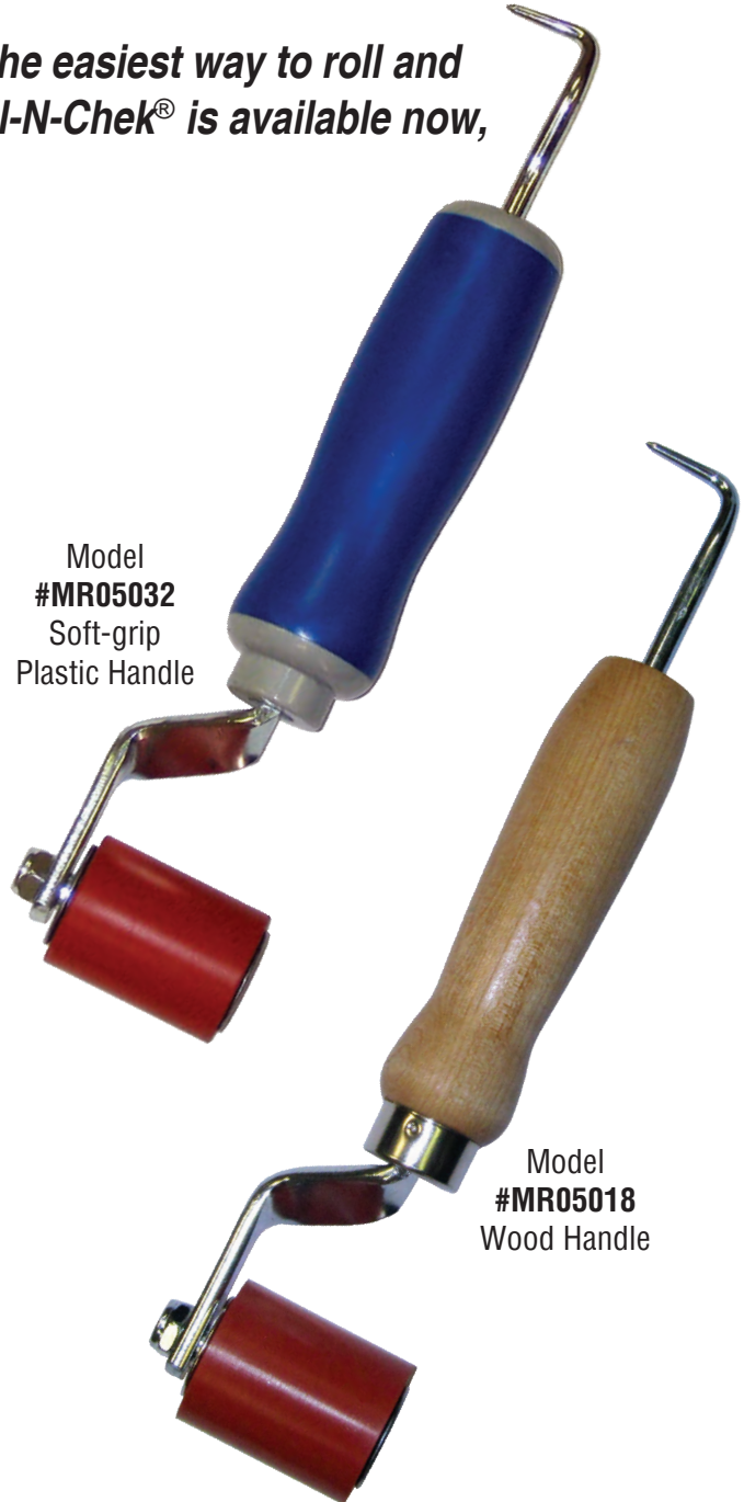
Model #MR05018 Wood Handle